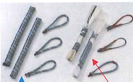
Rat Prevention tape Normal PVC tape