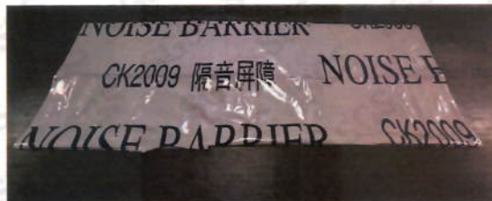
Sample received (Unfolded, printed side)