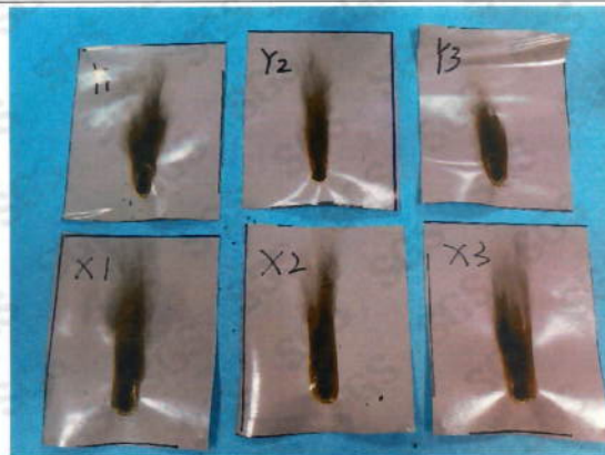
Sample after testing

SGS authenticate the photo on original report only