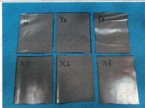
Sample before testing